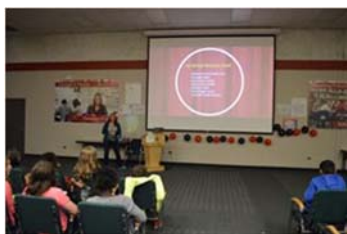
The Big Reveal – the books on next year’s MYRCA list!