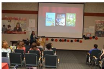
The Book Blind Date – checking out the nominees for next year’s MYRCA